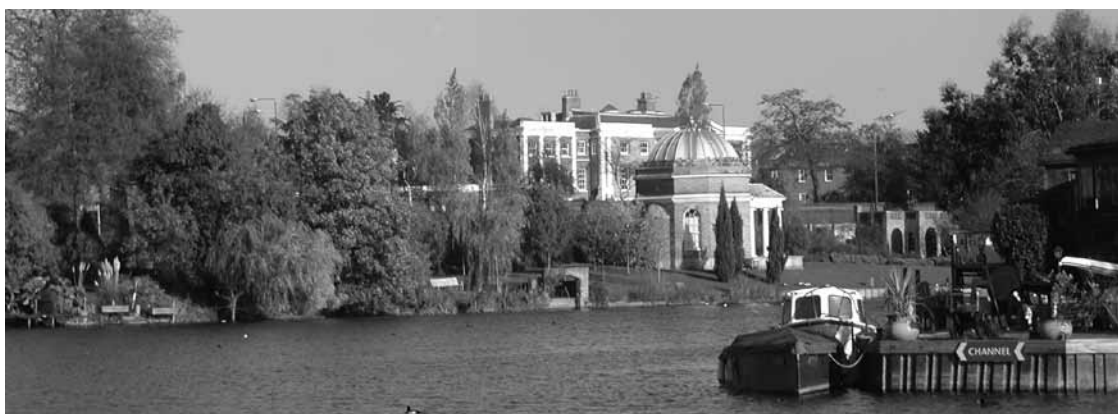
Garrick's Temple from Hurst Park between A and C